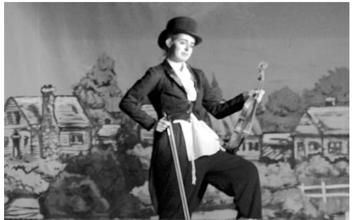
Fiddler on the Roof, Morris Park Players Fall 2008 production

Oliver! is based on a Charles Dickens' novel about tough economic times in London. It has many familiar Broadway songs and won a Tony Award for Best Musical Score. Performance dates are Fridays and Saturdays, Apr. 17, 18, 24, and 25 and May 1 and 2 at 7:30 p.m., as well as Sunday, Apr. 26 at 2:00 p.m. The Sunday performance is audio described. Morris Park Players encourages theatergoers to bring school supplies for Folwell students to the show.