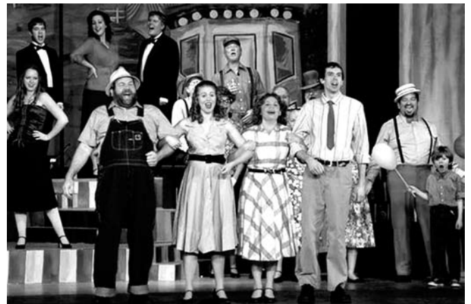
State Fair, Morris Park Players Fall 2007 production